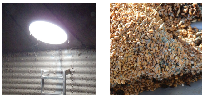
1. Grain clumps around or under manhole openings: