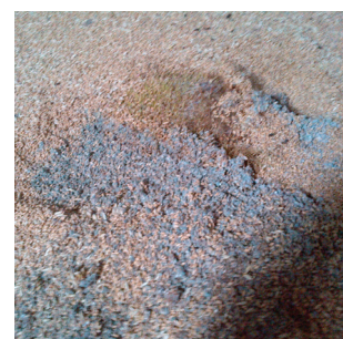
4. Surface bridging in high moisture migration areas: