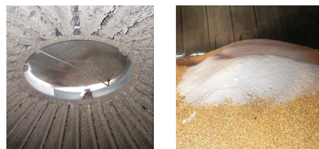
5. Moisture below dripping down spouts or vents from snow or rain: