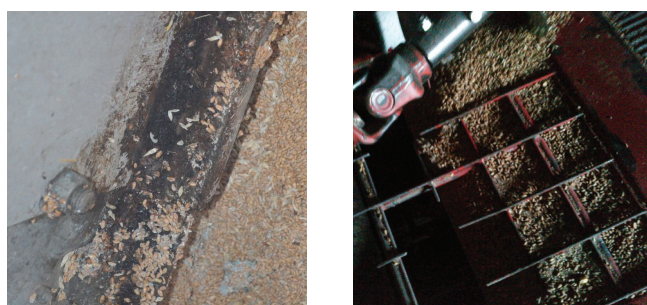
2. Crusted grain hang-ups and clumps from missing bolts or grain debris left on the floor and augers: