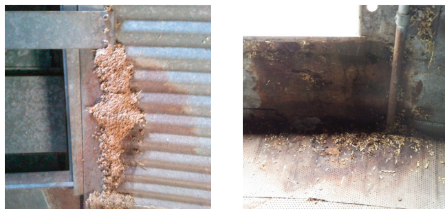
3. Grain clumps on side doors or on the holes of the bin walls: